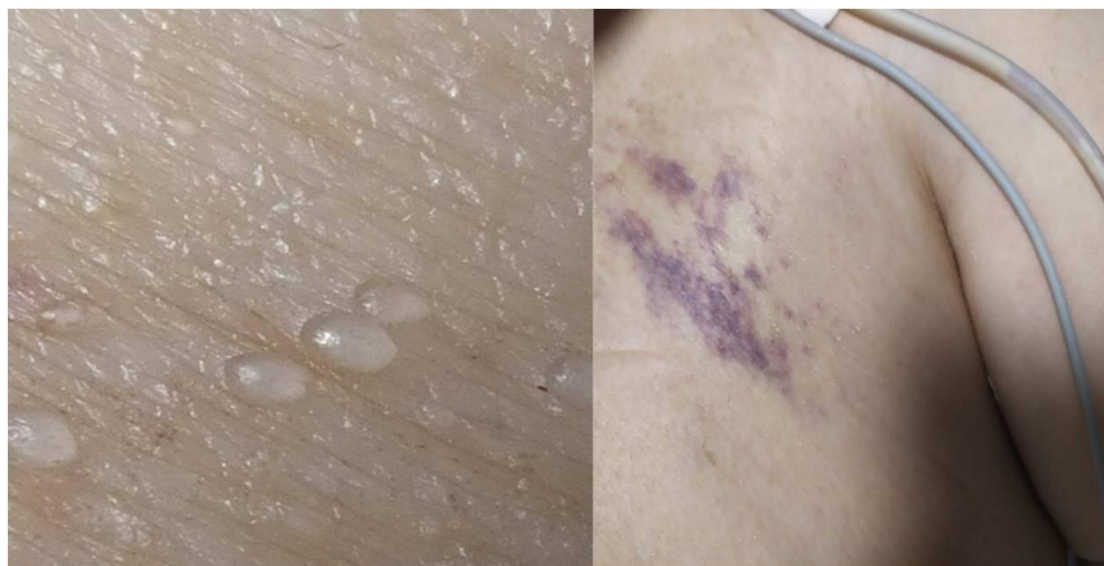
Figure 2: Bullae in the patient's chest. The image on the right is the patient's upper left chest area, the image on the left is the zoomed image of the same region.

not exceed 1 cm and spread on both shoulders and from the chest to the upper abdomen. Transfusion was stopped and methylprednisolone 1mg/kg and pheniramine 45.5 mg were administered to the patient. The allergic reaction that rapidly regressed after the first treatment and reported to the transfusion committee. The patient's blood transfusion was then continued with a slower rate of 40ml / hr, and transfusion was completed.