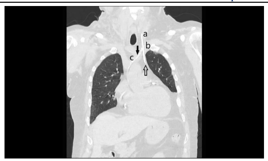
Figure 3: Non-contrast chest CT scan, sagittal view. A= left internal jugular vein, B= left subclavian vein, C= left brachiocephalic vein, Up arrow= the tip of central venous catheter in mediastinal malposition following a perforation of the left proximal brachiocephalic venous, Down arrow= the stenosis of the left brachiocephalic vein whose etiology is discussed in the text.