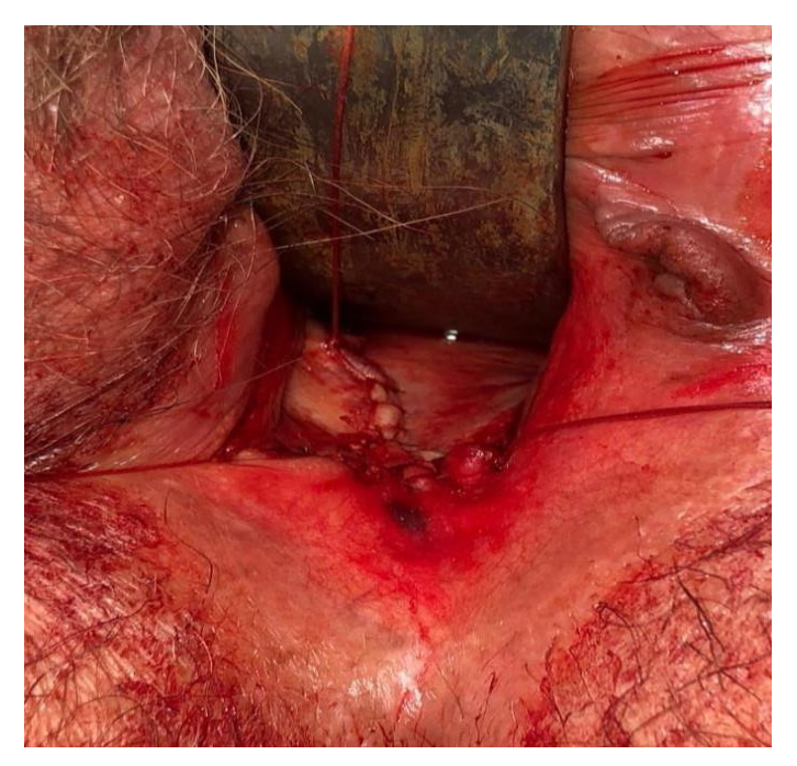
Image 6: vaginal introitus after actinomycotic mass/mesh excision and reapproximation of vaginal mucosa.