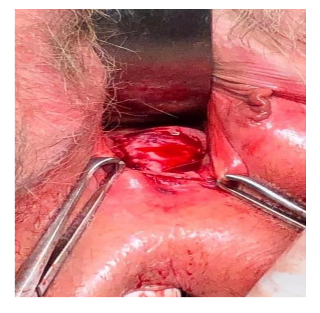
Image 4: posterior vaginal wall after dissection of the rectovaginal septum, excision of the mass and partial excision of mesh. No sinus tracts, fistulization or abscesses found.

reapproximated to the vaginal introitus ( Image 6 ). The final histopathological report demonstrated acute and chronic inflammation with granulation tissue and no evidence of malignancy. The patient was treated with 6 weeks of IV ceftriaxone followed by 30 days of oral amoxicillin-clavulanate, per infectious disease's recommendation.