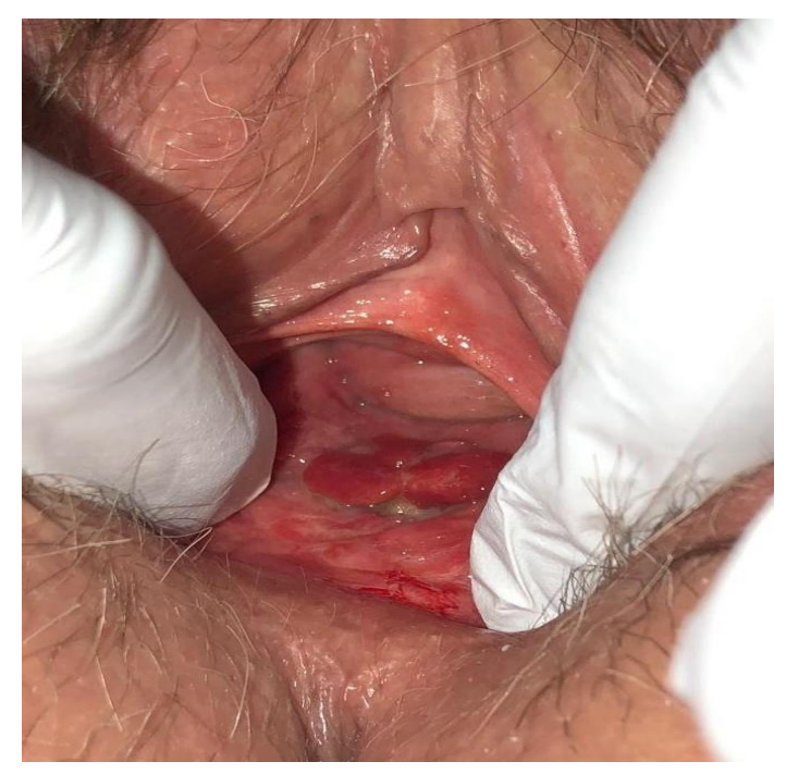
Image 1: 2 cm x 1 cm polypoid mass on posterior vagina, near colpoperineorrhaphy site, 1 cm proximal to the introitus. Granulation-like tissue. Source of patient's vaginal bleeding.

The patient had no known immunocompromising illnesses and was up to date with vaccinations and screenings. On examination, a 2 cm by 1 cm polypoid vaginal mass was noted ( Image 1 ), along the posterior midline near the posterior colpoperine or happy suture line, 1 cm proximal to the introitus. It appeared similar to granulation tissue and had no odour or necrosis.