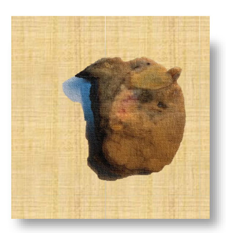
Figure 1: Low grade endometrial sarcoma

away from the deep serosal margins. The depth of myometrium invasion was 0.5 cm. Cervix, bilateral adnexa, bilateral parametria, and both ovaries were free of tumor invasion. The post-operative period was uneventful, and patient was discharged on 3<sup>rd</sup> postoperative day. MRI done postoperatively revealed no lymphadenopathy and no evidence of metastasis. She did not require chemotherapy and radiotherapy.