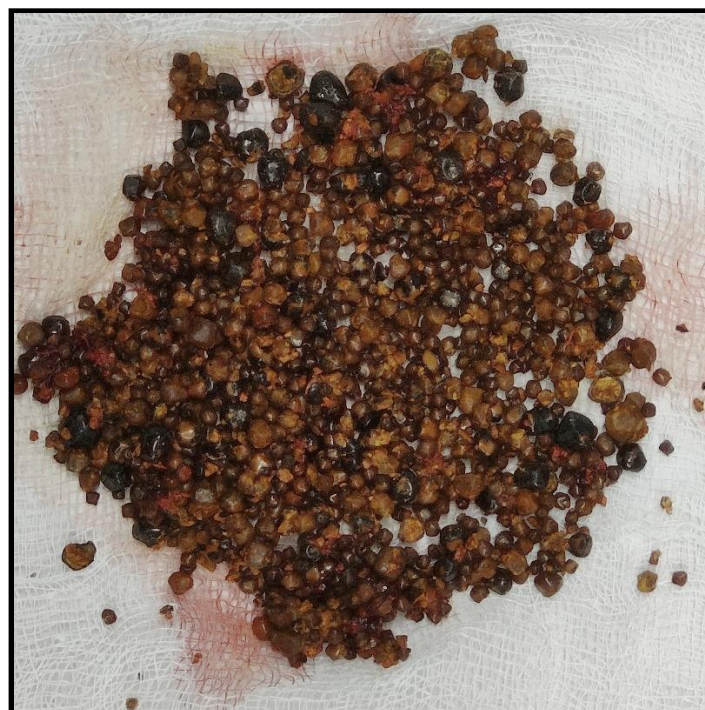
Figure 1: Multiple gallstones retrieved during laparoscopic cholecystectomy.

A 52-year-old male presented with right upper quadrant abdominal pain radiating to his back and vomiting for two days' duration. He looked sick, with BP- 120/70mmHg, HR- 96bpm, and temperature- 100-degree Fahrenheit. He was non-icterus and had Morphy sign positive. Blood workup showed leucocytosis with left shift (TLC=16300, Neutrophils = 90%). He was treated with antibiotic (inj. Ceftriaxone), analgesic and omeprazole). Ultrasonography was performed, which showed multiple small stones in the gallbladder. We did laparoscopic cholecystectomy and encountered a thickened fibrous gallbladder [Figure 2] wall with 425 stones of size ranging from 5mm to 1cm inside it [Figure 1].